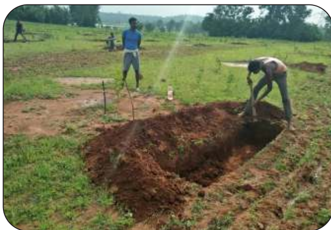
Soil Conservation in TDF Project