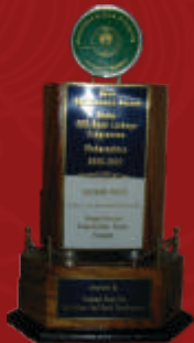
NABARD's Maharashtra State Level Best Performance Award Winner 06-07