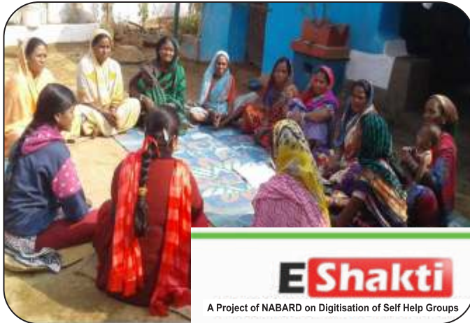
SHG Meeting under E-Shakti Project

the selected districts are digitized. Digitization brings all the SHGs on to the technology platform and into the fold of Financial Inclusion, thereby helping them access wider range of financial services. This helps bankers in client appraisal and credit dispensation. NCT, proudly took part in NABARD's this prestigious initiative, step for digitization of SHGs i.e. "E-Shakti". E-Shakti, that gives new definition to SHG movement is an opportunity for all the stakeholders like- SHG itself, its members, Bankers, PIAs, Resource agencies and Finally NABARD. The mobile App enabled bilingual (English and Hindi) system is easy to handle that with a little training a villager or a SHG women can operate it. Even a loan application can easily be generated