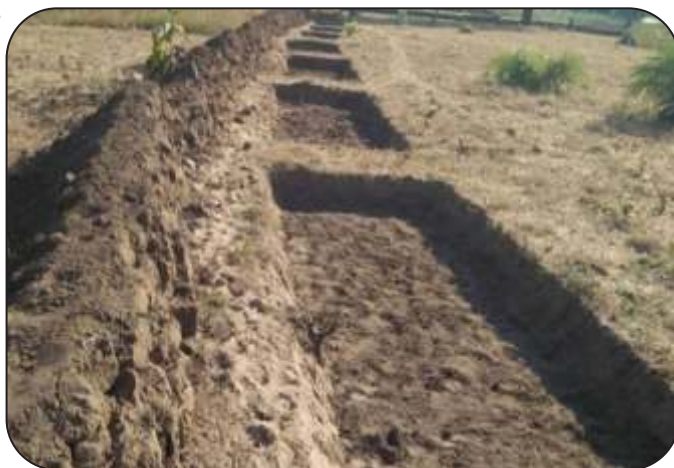
Farm bund in watershed - Jaitgundra