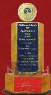
NABARD's Maharashtra State Level Amravati Division Best Performance Award Winner 10-11