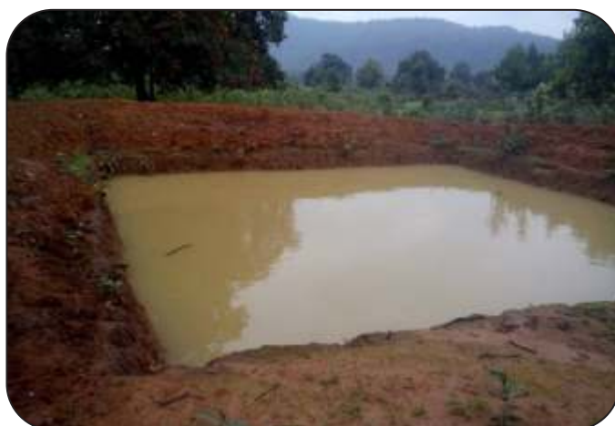
Farm pond in watershed - Khoba

NABARD's Chhattisgarh Regional Office has sanctioned 2 watersheds being implemented in Khoba (Jalgrahan Vikas Samiti Khoba) & Jaitgundra (Jalgrahan Vikas Samiti Jaitgundra) villages of tribal dominated Chhuriya block of Rajnandgaon district. The Capacity Building Phase (CBP) had been successfully completed by both the watershed communities. NABARD has sanctioned the Full Implementation Phase (FIP) during May 2016. The sanction details are as under: