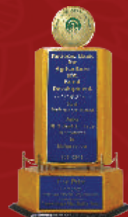
NABARD's Maharashtra State Level Best Performance Award Winner 11-12