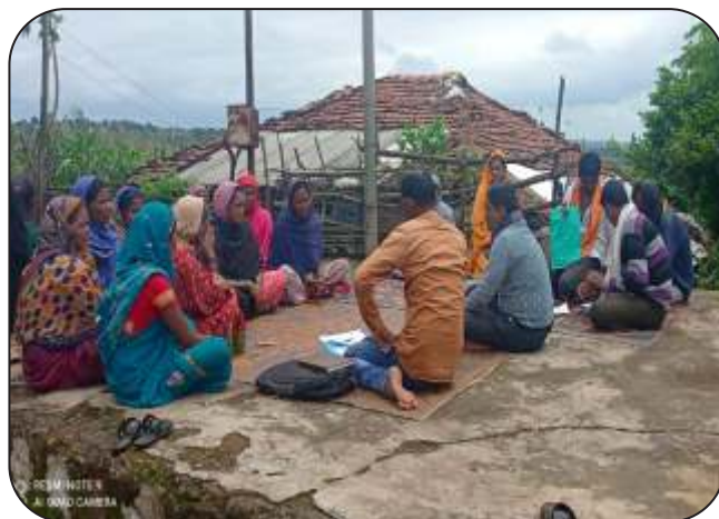
Promotion of SHGs under NULM