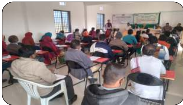
Training at LIFE Center, Tamia