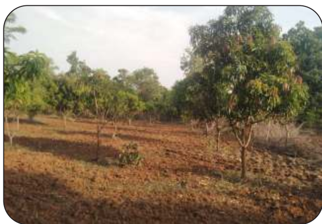
Ploughing in Wadi