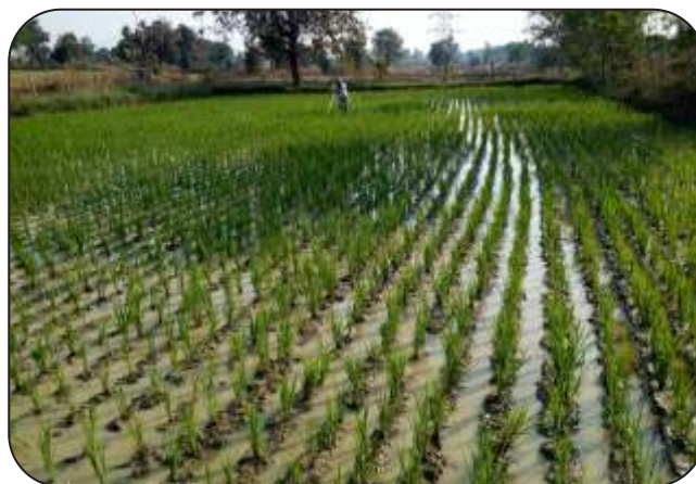
SRI in TDF Project