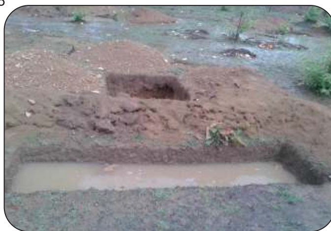
Trench & Pit in Wadi Project

It is also technically proven that proper contour trenches have a highly positive effect on survival of horticulture plants. Also due to improved and increased soil moisture, the beneficiaries can easily go for Rabi intercropping, which fetches additional income to the family. NCT propagates