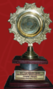
NABARD's Maharashtra State Level Best Performance Award Winner 07-08