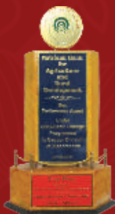
NABARD's Maharashtra State Level Nagpur Division Best Performance Award Winner 10-11