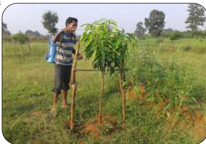
Gomutra and Milk Spray

Since inception, NCT is successfully convincing the farmers to convert the amount available as labour charges into purchase of barbed wire for fencing. Even farmers are willing to put in a little money as the amount available as labour charges is not sufficient. Barbed wire fencing has not only helped in protection of the Wadis, but also has helped in building the much required confidence amongst the farmers to take up the Wadi maintenance as in Horticulture crops the benefit is seen only after 4-5 years.