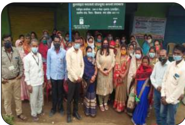
NABARD DDM-Chhindwara visit to KULBEHRA FPCL at Chourai block

farmers who are the backbone of the Indian Economy have always felt neglected. Farmers put in a lot of hard work to make the two ends meet. They have to face a lot of hardship for their survival. Right price for their produce, role of middle-man, easy availability of inputs, unavailability of technology for enhancement of production are the common questions raised when it comes to our farmers' welfare. The country's focus is on improving farmers' socio-economic status through collectivize and provide legal entity to the farmers in the form of Farmer Producer Organization/Company under The Companies Act 2013 through which they would be able to get Agri-inputs at minimum costs and sell their produce at maximum prize. This will also help the farmers'