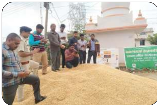
Online Trading of Maize through e-NAM by Vainganga Agro FPCL, Seoni (M.P.)

linkages, credit linkages, Equity Grant Support and fulfil the all legal compliances & audit. These FPOs are doing various business activities since inception like providing Agri-input like seeds, pesticide, fertilizers to the member farmers and marketing support to farm produce like maize, pulses, wheat, gram, paddy, mango, guava, custard apple, etc. Along with, FPOs are branding & marketing of their member produce through online & offline platforms by their brand names. All the 12 FPOs are working well in their respective locations and doing many business activities and providing benefits to the member farmers. The membership & businesses in the FPOs are increasing gradually. The detail of these 10 FPOs and their location are below:-