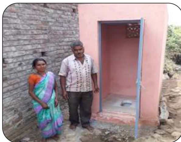
Beneficiary under Arogyalaya Yojana