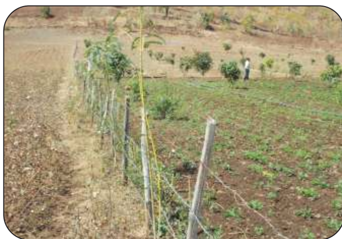
Fencing in Wadi Project

Very interestingly, it is observed that, any beneficiary who has completed 100% trench and pit as per prescribed dimensions has taken care of his Wadi properly. At the same time, the farmers who have not completed the trenches and pits have neglected the wadis and some of them have migrated, in spite of strong efforts by the project implementation team. It clearly shows that 100% trench and pit making is a “once in a life time” activity and very tough to achieve. Once it is done properly, the farmers normally take care of their Wadis as they do not want their efforts to go waste. Hence, NCT ensures that all farmers dig the trenches of 8ft X 8ft x 8 ft and pit of size 41'x 41'x 41'. This has helped the Trust to maintain (1) High survival rate (2) involvement of the beneficiary and (3) excellent health of horticulture crops.