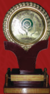
NABARD's Madhya Pradesh State Level Best Performance Award Winner 07-08