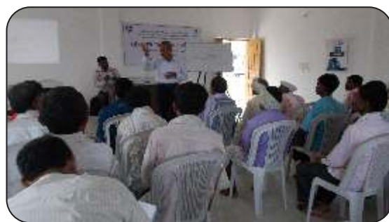
Farmers Training at AKC